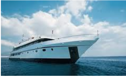
Sleek, elegant, and all ours. The Harmony G

able to see the cistern of Philippi where Paul was imprisoned, and we will enjoy a lively study together at the site of the prison itself. We return to our hotel in Thessalonika tonight. BLD