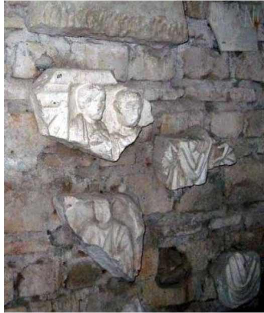
Pieces of preserved fresco in the catacombs of St. Domitilla, the oldest known of Rome's catacombs and burial place of many early Christians.

Oct 30 Early today, we'll visit the Vatican, Vatican City and its museums, ending with the spectacular painting of the "Last Judgment" on the ceiling of the Sistine Chapel. On our return to the Old City of Rome, we view Scala Sancta, the stairs said