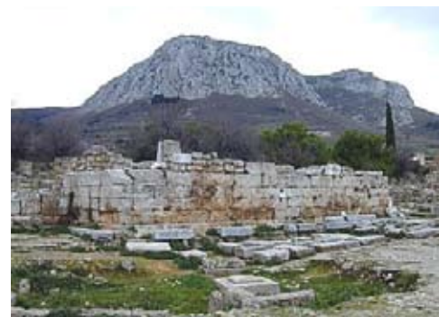
When the Jews of Corinth brought Paul before the tribunal, the proconsul (Gallio) stood on this platform (bema) and declared Paul innocent of any crime.

Nov 1 Today, we travel to the lovely port town of Kavala on the Mediterranean. This is ancient Neapolis where Paul, Silas and Timothy landed. It is also here that Lydia became the first European convert to Christianity. You will be