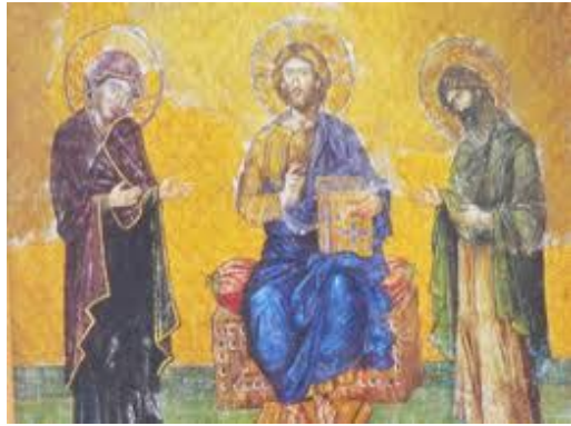
One of the stunning mosaics at Istanbul's Hagia Sofia

site, has great beaches and a quaint harbor and is known as one of the sunniest places in all of Europe. BLD